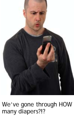
We've gone through HOW many diapers?!

We are excited to announce the availability of Baby Manager Web and Mobile! Scroll down to read an inspiring testimonial and two press releases. Microsoft Corp. is quoted in both releases! Please tell your friends, family, and business contacts about us and direct them HERE