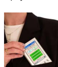
Babble Soft On The Go!

Babble Soft and Cressanda Solutions Develop Baby Manager Web and Mobile Applications (AUSTIN, TX - March 5, 2007) - Babble Soft, a leading supplier of software solutions in the baby market, has partnered with software development company Cressanda for the creation and deployment of Baby Manager Web and Mobile applications.