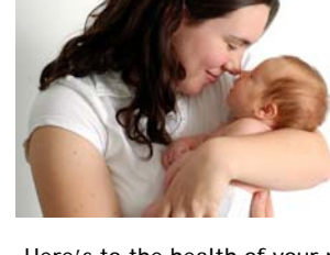
Here's to the health of your new baby and to your peace of mind...

What's more, for busy breastfeeding moms, keeping track of pumping and medicine intake helps with the management of stored breast milk. Also, when asked, "What did you do all day?" breastfeeding moms can proudly and confidently show a report online, on a mobile device, or on paper the time they spent feeding their baby which can range from 3 to 6 hours per day (i.e., 20 to 40 hours per week!) depending on the baby and the mom. The application summarizes the data in easy-to-read graphs and reports that can be printed out to show friends, family members, or health care professionals.